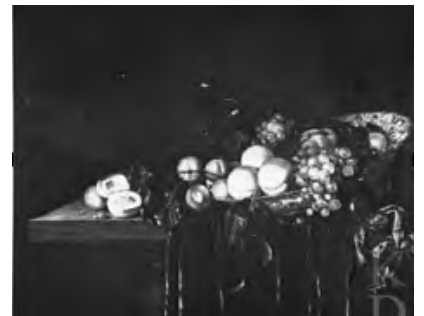
Mauritshuis, The Hague (inv.Nr. 150), Canvas, 55 x 70cms, Signed