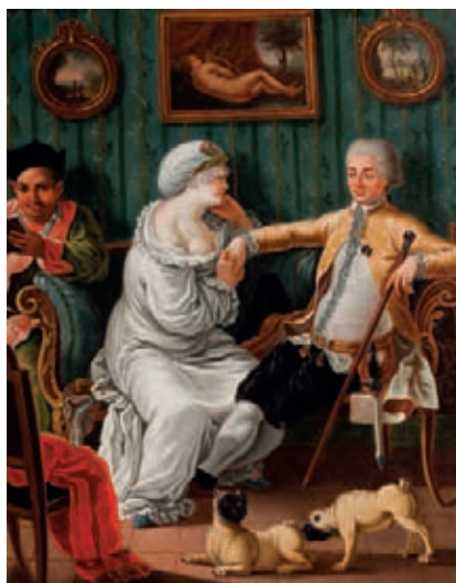
A Romantic Encounter