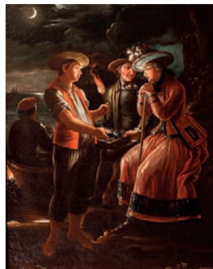
The Fish Seller