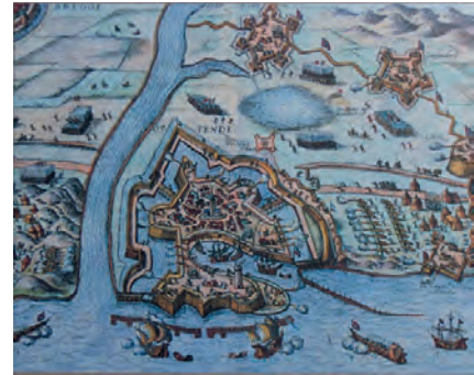
A view of Ostend

A very similar panorama of Ostend by the artist, but on a much larger scale, is in the Groeningemuseum, Bruges (inv. nr. 0000.GRO1284.1). This composition was engraved by Gaspard Bouttats in 1675 giving us an approximate date for this group of paintings. A similar, albeit even larger view was sold at Sothebys from the Estate of Kalef Alaton in January 1992 (lot 135).