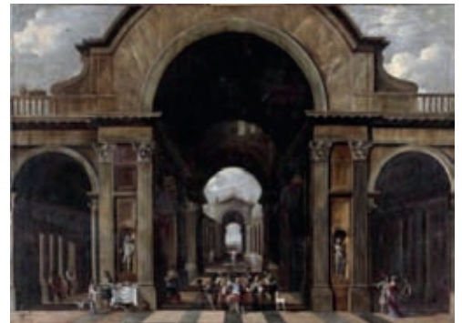
Vicente Giner, Oil on Canvas, 121 x 167 cms, Signed. Museo de Bellas Artes Valencia (Inv. 167/2004)