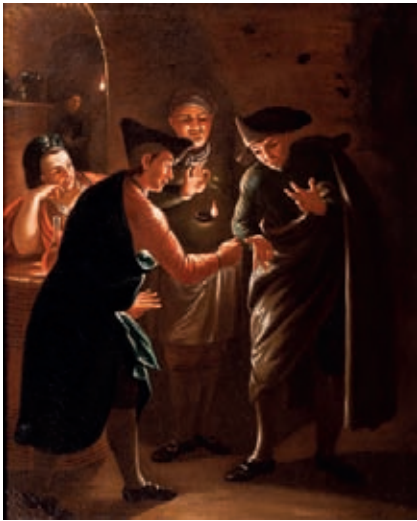
Settling the Wager