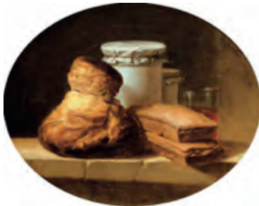
De la Porte

De la Porte depicted a brioche a few times notably in a still life sold at Sothebys, New York in January 2005 and inevitable comparisons can be drawn with Chardin’s still life of a Brioche in the Louvre.