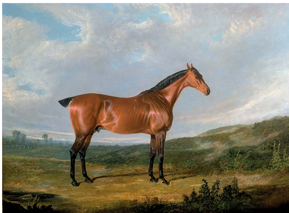
HERRING SR, JOHN FREDERICK 1795 – 1865

Oil on Panel. Signed: 'J.F.Herring'. 6 1/8 x 7 15/16 ins, 15.5 x 20.2 cms