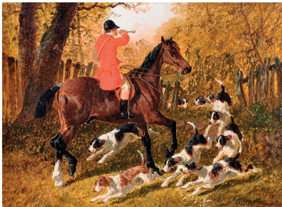
HERRING JR, JOHN FREDERICK 1820 – 1907