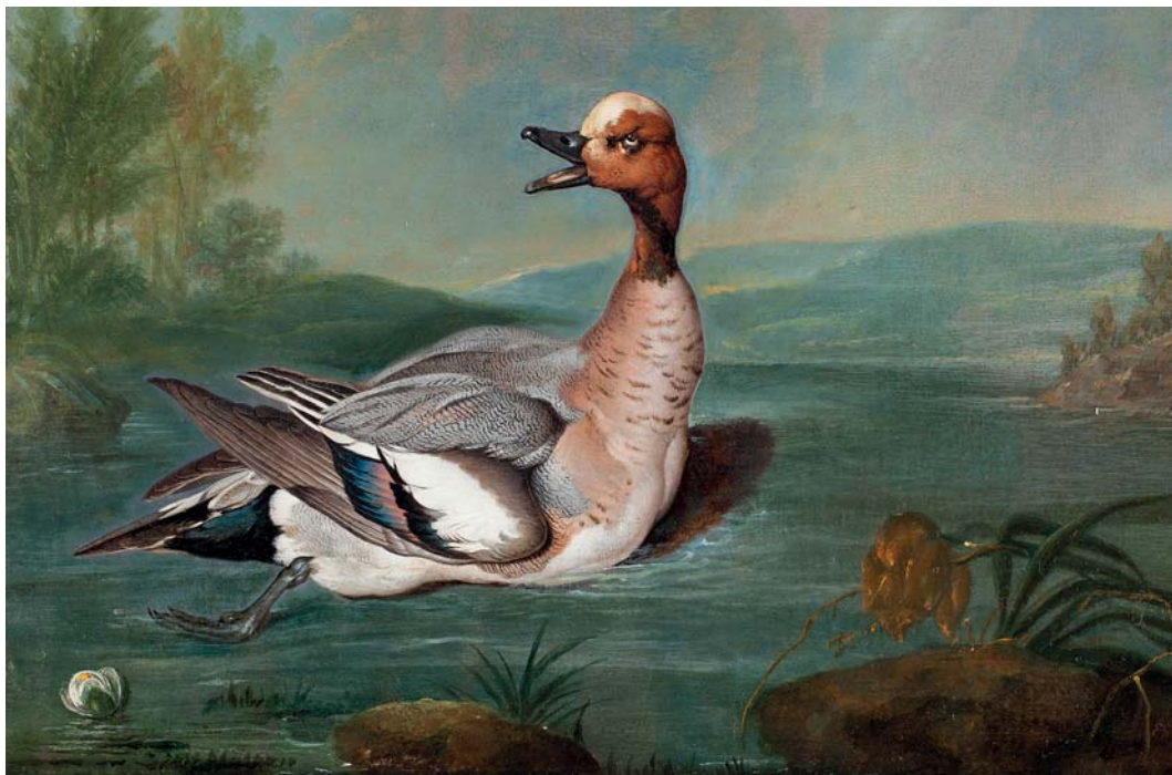
HAMILTON, PHILIP FERDINAND DE HAMILTON circa 1664 – 1750