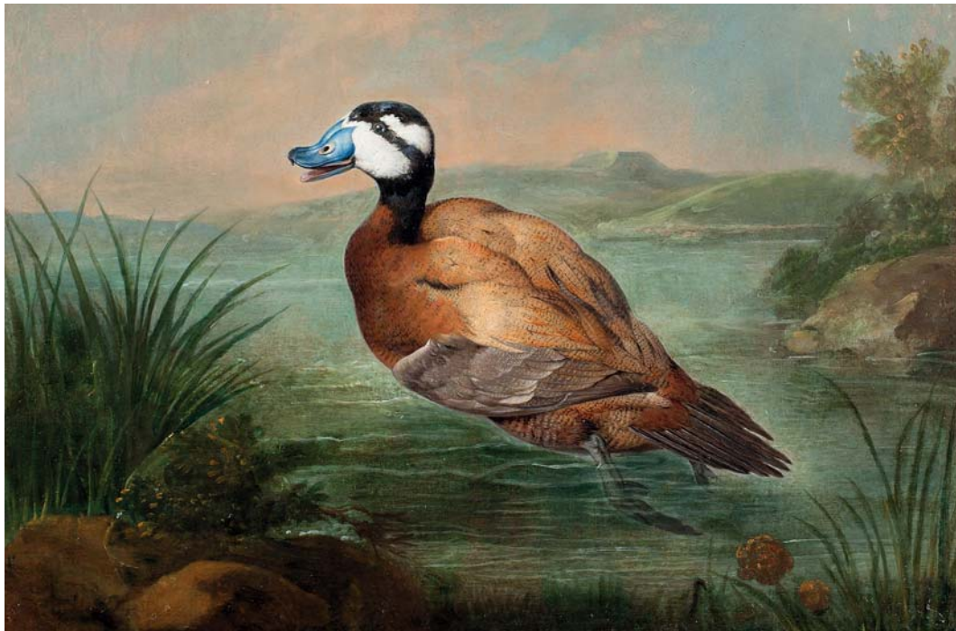
HAMILTON, PHILIP FERDINAND DE circa 1664 – 1750