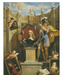
Frontispiece to the Theatrum Pictorium

David Teniers worked on the Theatrum Pictorium in the 1660s. It was a record of the most important Italian paintings in the collection of the Archduke Leopold Wilhelm of Austria. He had amassed one of the greatest art collections of the age while governor